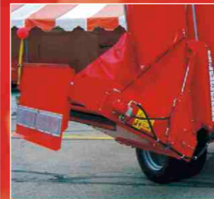
Discharge chain conveyor or belt conveyor as an option.

The Solomix 800-1400 is standard equipped with Unique one auger drive system, Hand jack, Low drawbar with clevis, Constant velocity PTO shaft, Two manual restrictor blades, Five-nine hardened auger knives, Two wide wheels, tires 400/45 L 17.5, Large door opening at front, Left- and right-hand belt discharge (model VL) or two large side doors (model ZK), Heavy Duty planetary drive, Remote control by Bowden cable operation (model VL) or to be connected directly to tractor hydraulics (model ZK), Wear rim.