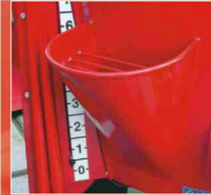
Mineral chute as an option.

* Electronic weighing system * Extra large display (digit size 43 mm/1.7") * Extra, separate display (digit size 43 mm/1.7") for loading from two sides * Programmable weighing Indicator with datakey, docking station and software * Hydraulic jack * Hydraulic jack with weighing sensor and battery * Hydraulic operation of the restrictor blades * Reduction gearbox for smaller tractors * Adjustable cross conveyor belt extension (model VL) * Speed regulator for cross conveyor belt * Belt/Chain conveyor * Valve set for Bowden-cable operation (model ZK) * Electric operation * Hydraulic brakes * Pneumatic brakes * Off set clevis * Lights * Hay ring * TC coated augerknives * Mineral chute * Magnet kit