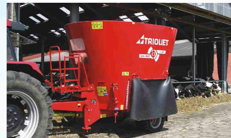
Solomix 1, model ZK with rubber side door covers.