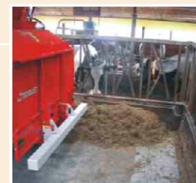
Solomix 1, model AL with cross conveyor belt at the back of the machine.