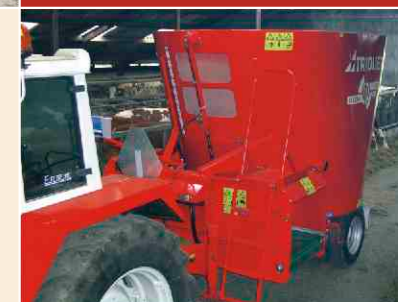
Discharge in 2 directions.