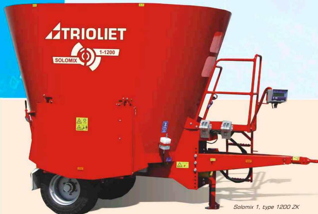
Solomix 1, type 1200 ZK