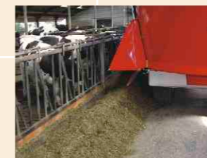
Complete regular discharge by new type of discharge door.