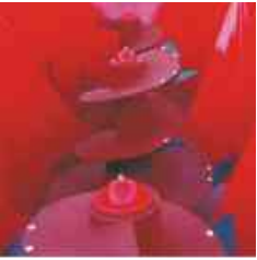
Unique three auger system with horizontal flow system.