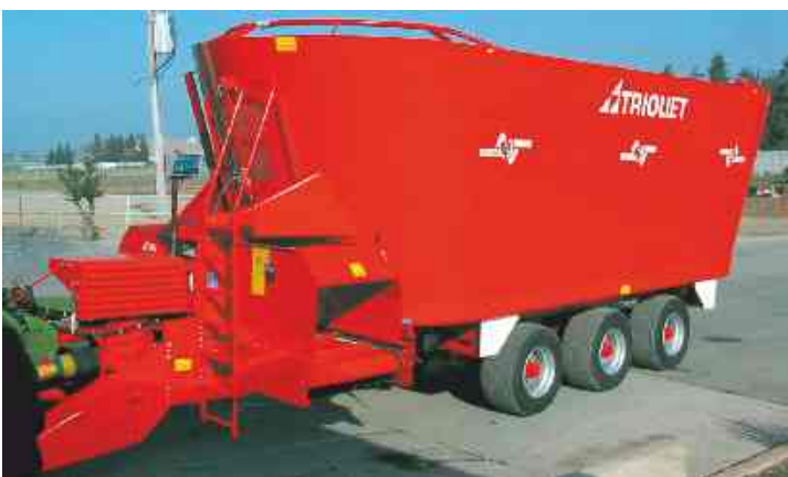
Solomix 3, 4600 VLK T.