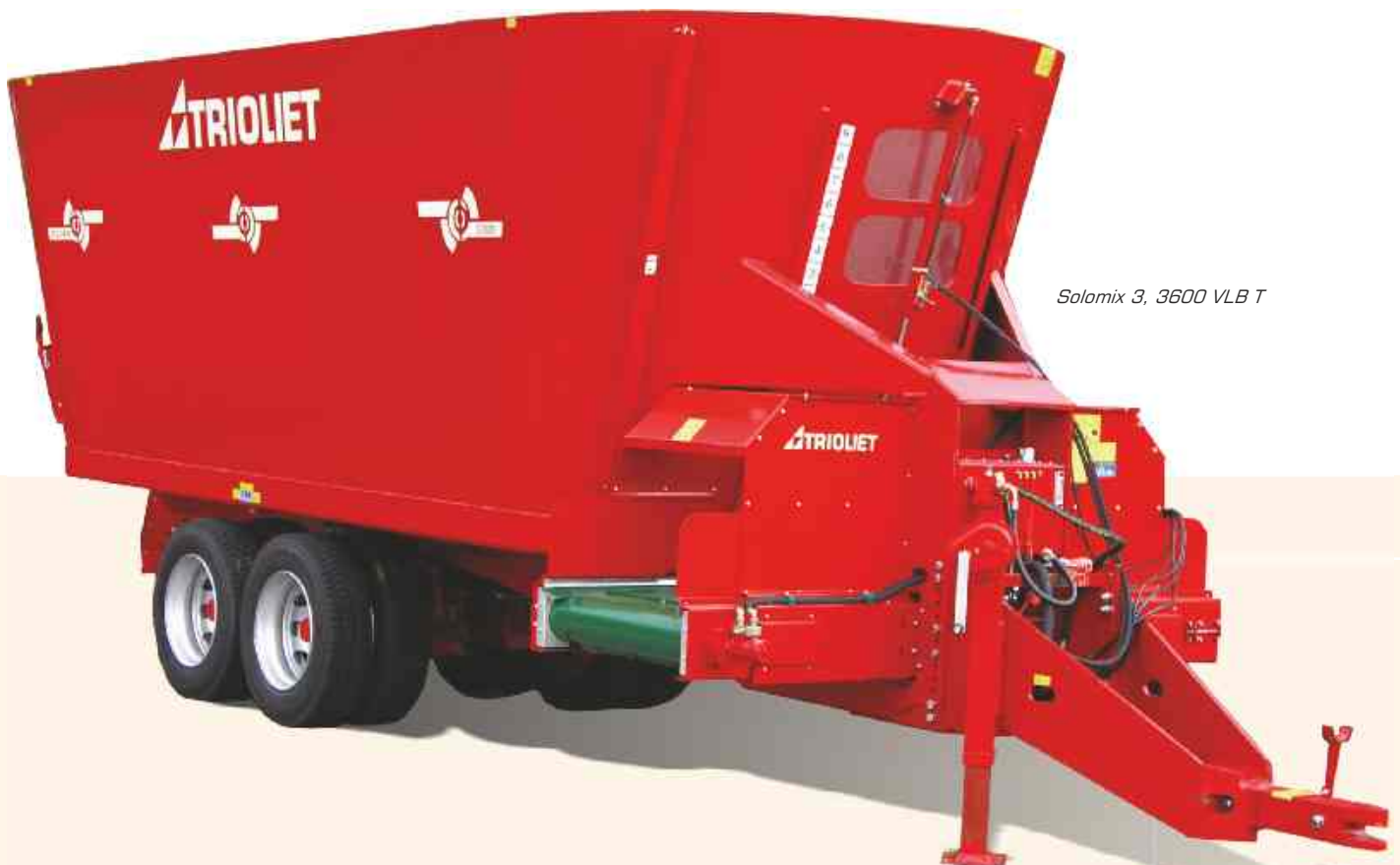
Solomix 3, 3600 VLB T

Regardless of your farm situation, Trioliet offers you a suitable machine that can distribute the required feed at all times at the right place and in the right quantity for your cows.